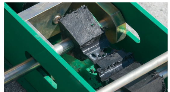
Destructively tested coupon